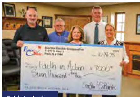
Faith in Action

Youth to Washington – apply today to represent EnerStar in D.C.