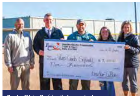
Paris Girls Softball Association