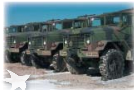
For several years, EnerStar Power has served as a storage location for the 1544th guard vehicles

Several military relief funds have been established for those serving on active duty, including one dedicated to those in the 1544 th guard unit. If you would like to donate to the relief fund, contact the 1544 th office for more information.